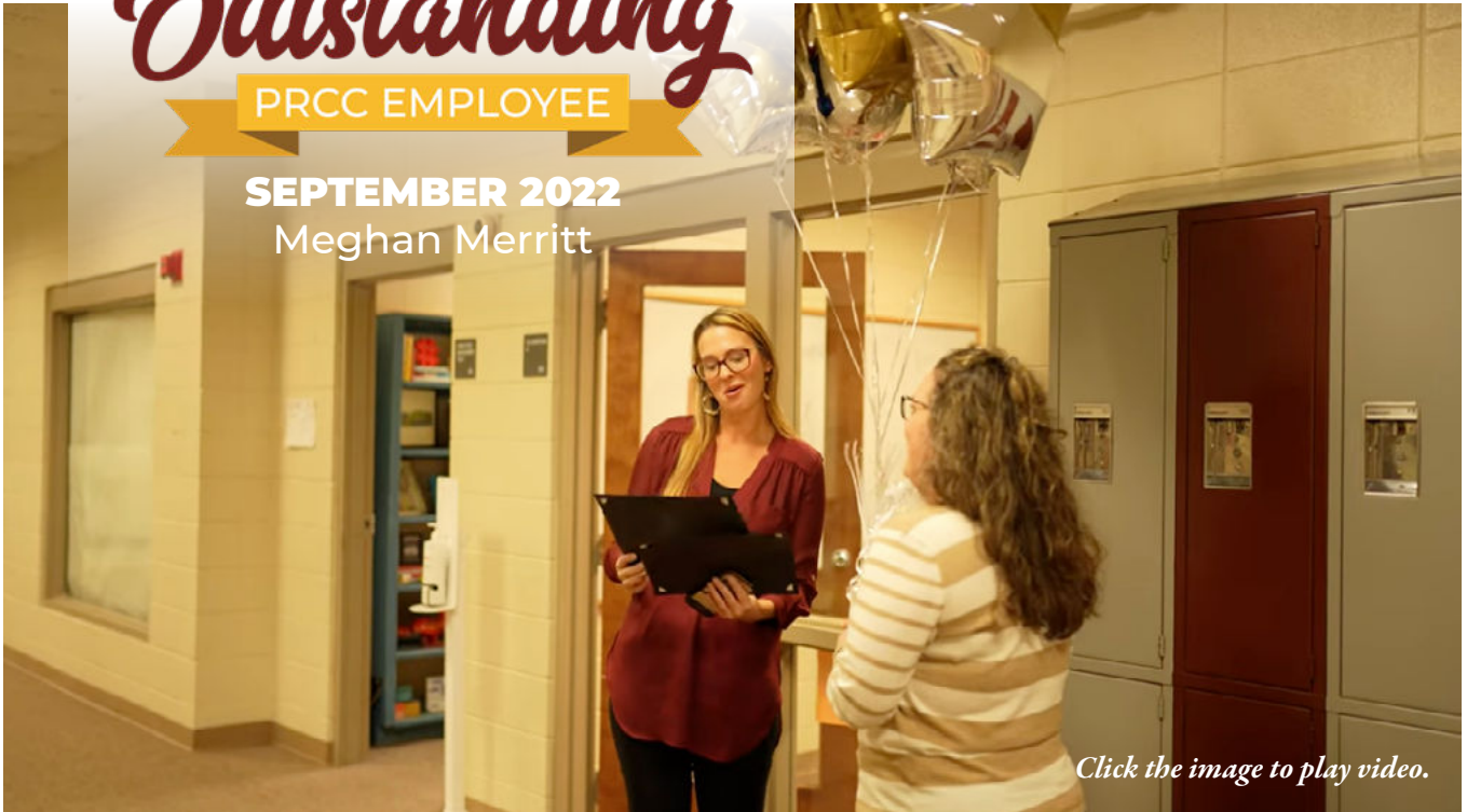
Click the image to play video.