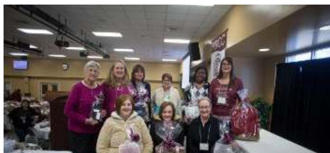
Grand Prize Winners