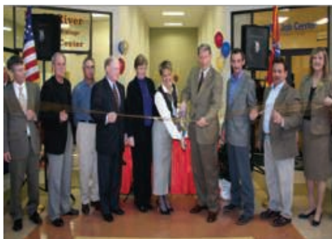
Ribbon cutting Hancock Center

students. As the population returns to Hancock County after Hurricane Katrina, it is